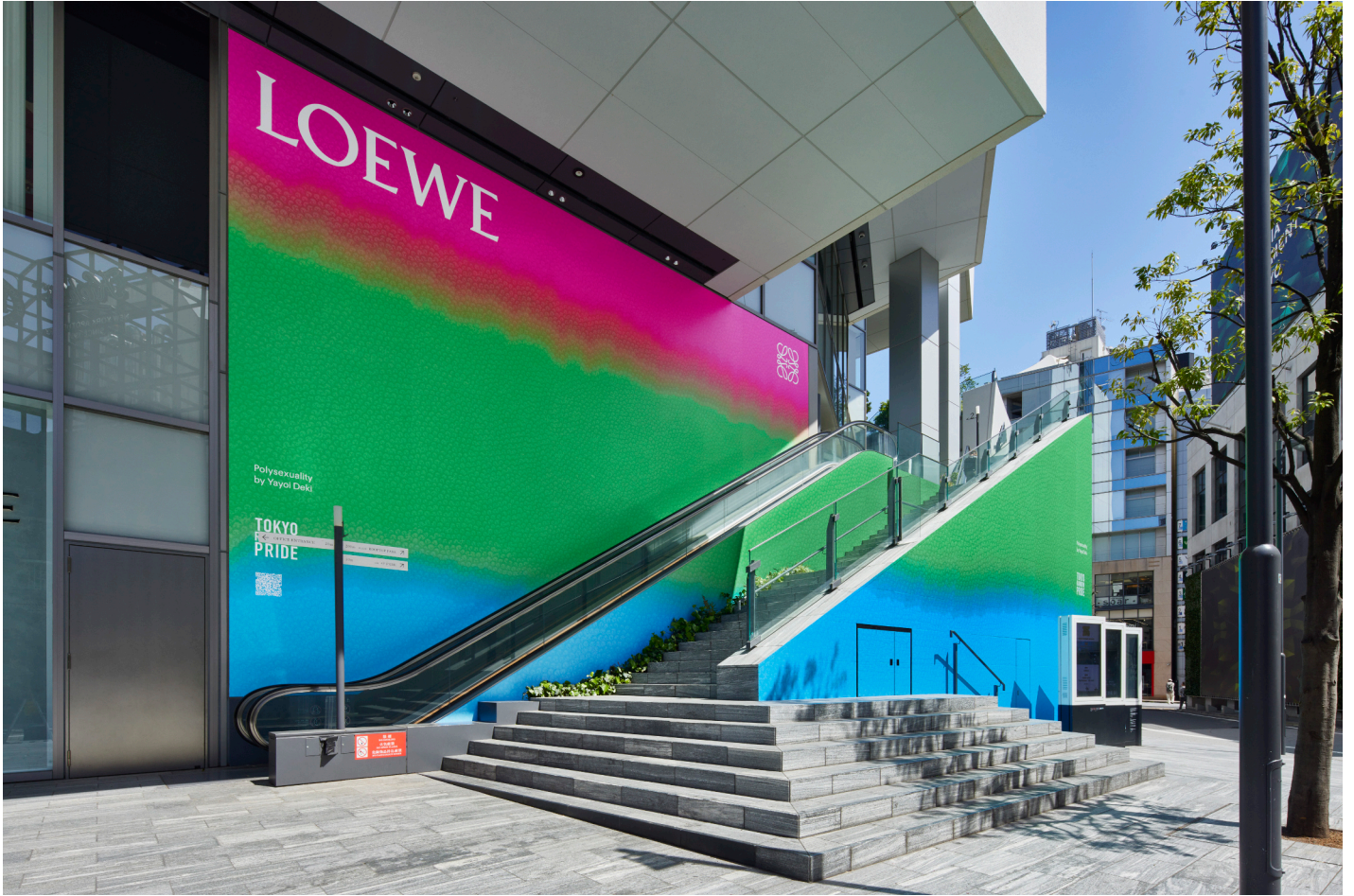
(Reference) LOEWE Japan with Yayoi Deki for Tokyo Rainbow Pride 2024, installation view at Shibuya PARCO, Tokyo, 2024