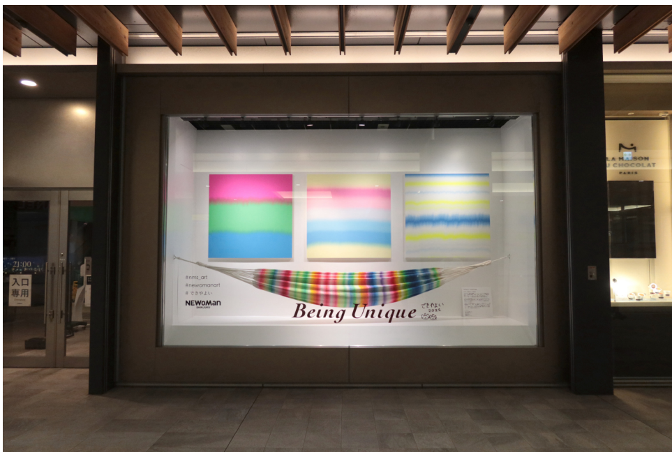
(Reference) "Being Unique" Installation view, NEWoMan Shinjuku, Tokyo, 2022