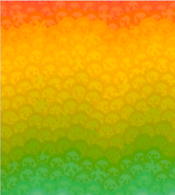
Pride Of Africa (detail)