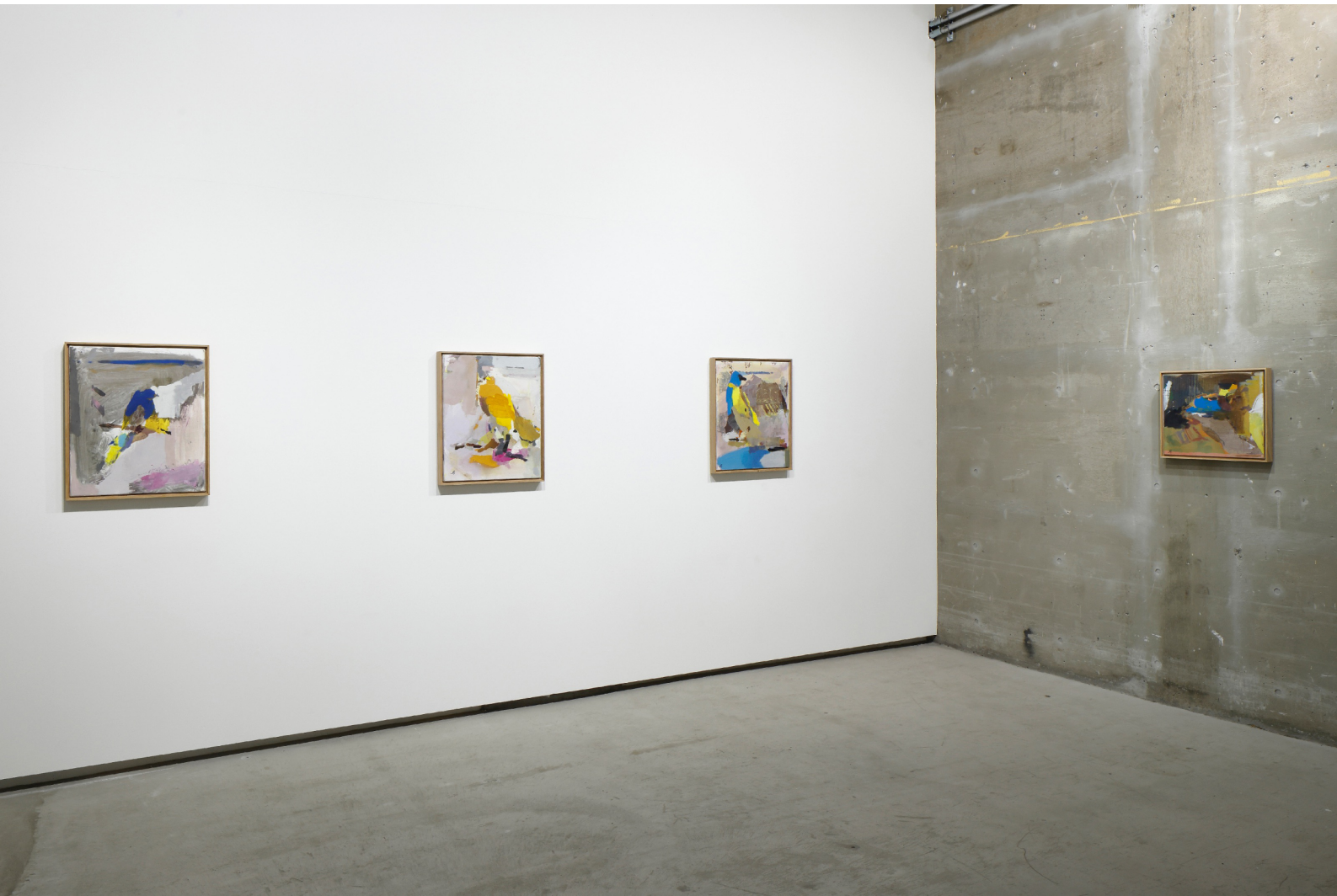
(Reference) "Seeing Like a Planet" Installation view, ANOMALY, Tokyo, 2025