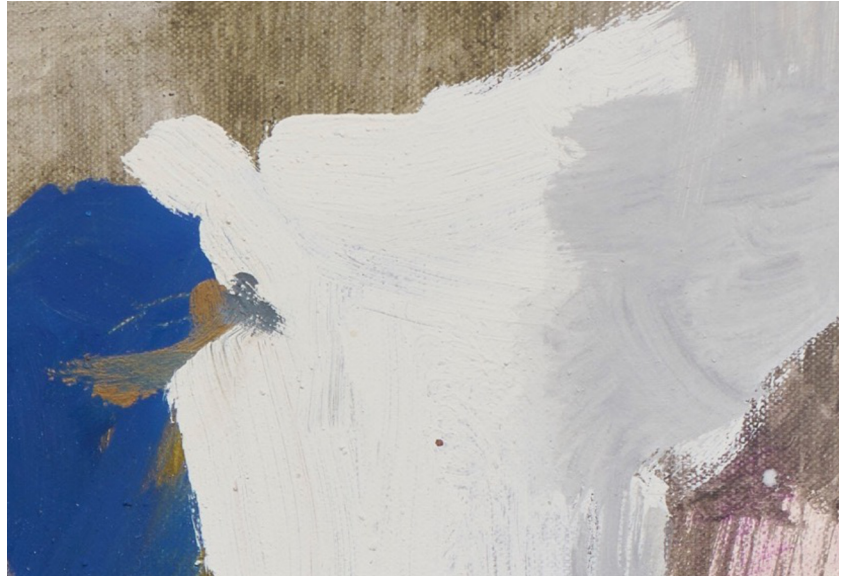
Witness of Desert Incognito (detail)