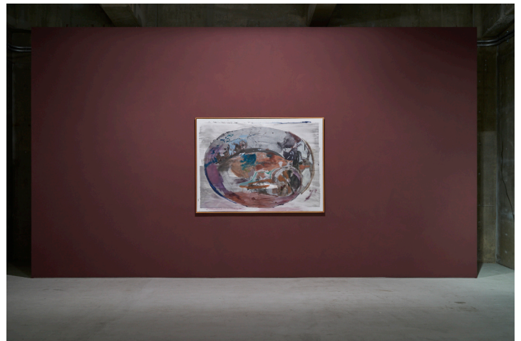
(Reference) "Exactly Like How a Child Who Watched Sugar Gradually Dissolve in Water Wonders Why Our Bodies Do not Dissolve That Way in the Bathtub"* *Jean Cocteau, in "A Conversation with André Faigneau" Installation view, ANOMALY, Tokyo, 2019